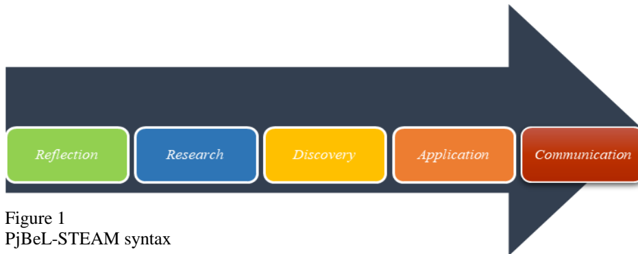
Figure 1 PjBeL-STEAM syntax

once data obtained using the Kolmogorov-Smirnov test, whereas the homogeneity test carried out using Levine's test and hypothesis test used an independent t-test.