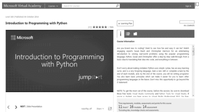
Fig. 4. Course «Introduction to Programming with Python»

Using social networks, IT specialists are able to obtain new knowledge individually because they have open access to professionally-oriented information that is covered in magazines, newspapers, books, videos, blogs, etc., to fast share information with peers who are users of social networks and have common professional interests; to discuss issues on information technology. In addition to social networking sites, there are special professionally orientated in IT sites which contain a large number of manuals, code samples, links to download software, discussion forums, blogs, etc.