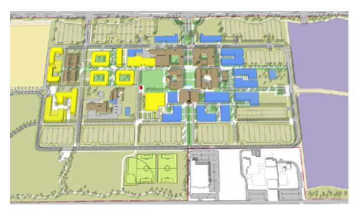
proposed conditions (2020)