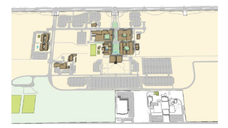
existing conditions (2011)

The West campus has seen slow enrollment growth in past decades. The investment in on-campus housing, student recreation, and dining services will provide a much needed boost to the quality of life on campus. Coupled with the campus's intimately scaled courtyards and central lawn, transition from a commuter campus to a residential campus will provide an additional attraction for recruitment.