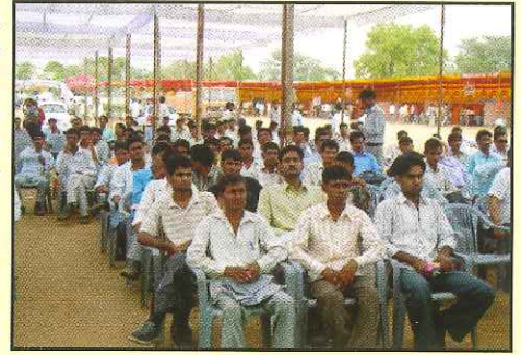
Aspirant Youth For Employment During The Rozgar Mela At Sikar