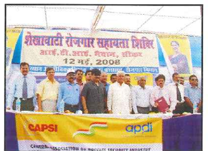
Security Professionals Standing with Sh. Ram Kishore Meena, Hon'ble Labour & Employment Minister of Rajasthan