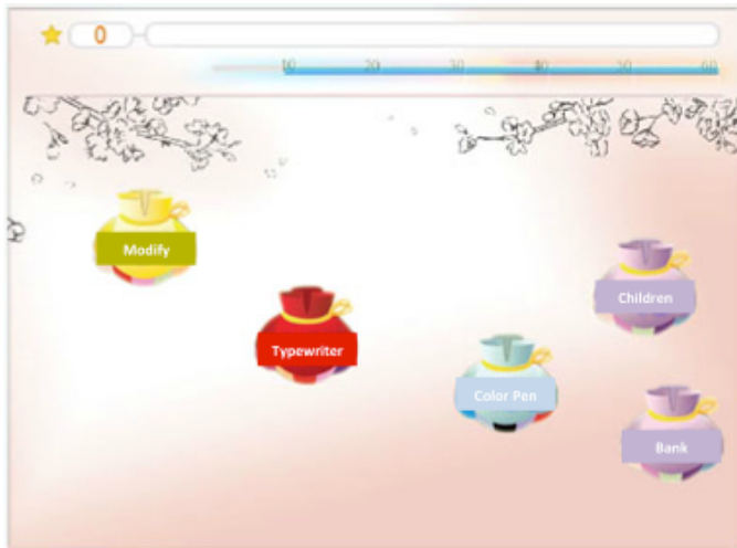
Fig. 2. A Screenshot of "find a word" training component *

Computerized Cognitive Training Apparatus (CoCoTA) is a cognition-training program to improve and maintain cognitive function for the middle-aged and old people. It is basically a self-training online program for people with MCI and for normal people as well, which records the history of the training and manages the cognitive health of a user. It consists of 14 cognitive training tools.