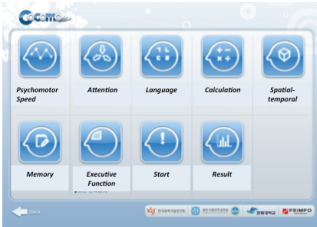
Fig. 1. A Screenshot of CoCoMO (Computerized Cognitive Assessment in Middle Aged and Older Adults) *