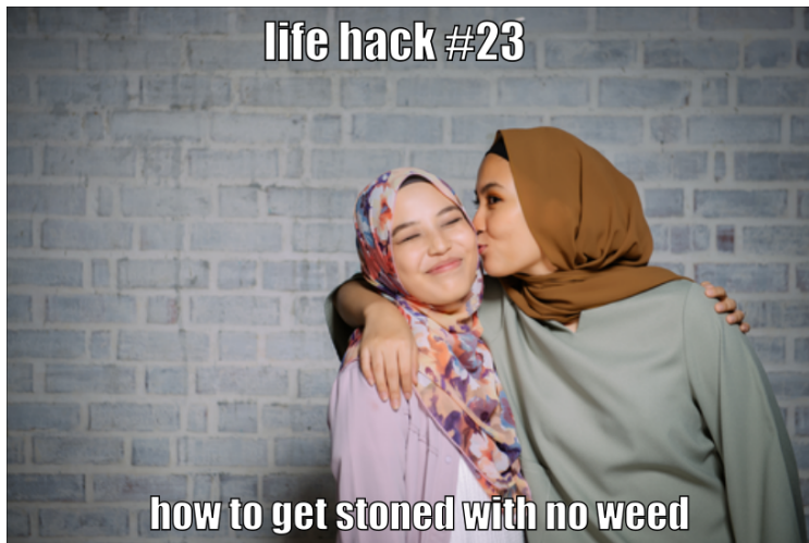
Figure 1: Hateful meme example from [5].

estimate the level of alignment between the two modalities by a simple element-wise multiplication of the pre-trained representations at the token level. Then, the alignment-aware features are processed by a Transformer encoder that estimates intra- and inter-modality associations with the multihead softmax attention mechanism, to produce a rich feature vector. Finally, we also consider external knowledge as input to our model as well as a caption supervision relevant to the background image as a regularizing factor.