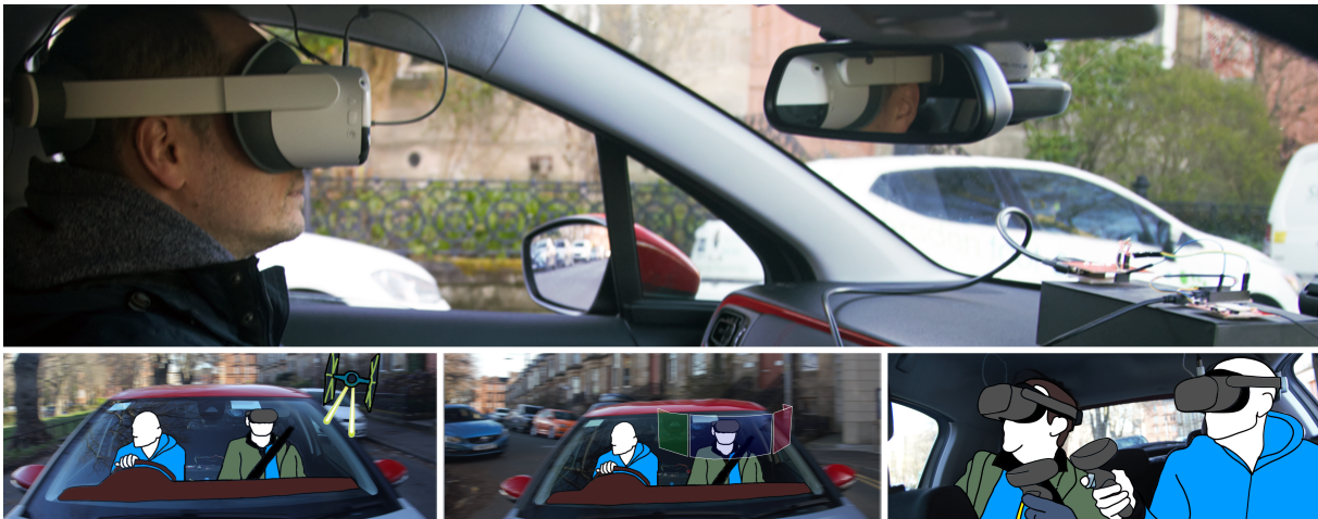
Figure 1: PassengXR lets practitioners create multi-passenger XR experiences based on the motion of any vehicle, supporting immersive gaming (bottom left), productivity (bottom middle) and collaboration (bottom right).