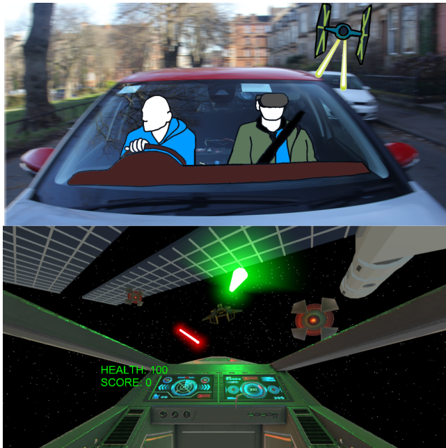
Figure 4: Illustration showcasing the Matched Virtual and Physical Movement application (top), where the movement of the virtual spaceship (bottom) reference frame matches the movement of the real car the passenger is inside.

in the Configuration with an appropriate alignment approach set. The cannon is aimed via the rotation of the VR controller, and fired with the trigger button. We used assets from the Unity asset store to create the experience [1, 8–10, 20, 46].