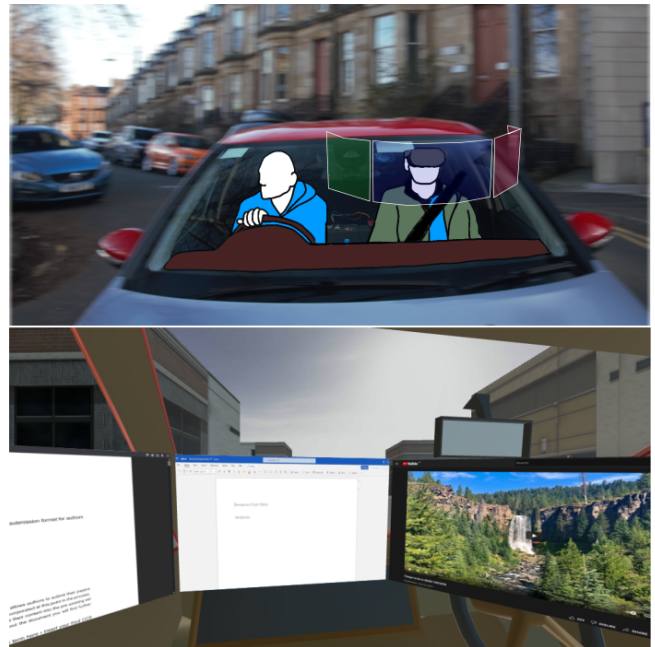
Figure 5: The Movement-Locked Content for Productivity application, where a single user interacts with web-based word processor, pdf and video content locked to the reference frame of the virtual vehicle they are sat inside. A digitised city route updates around the vehicle based on the real location.

the reference frame based on the VehicleProtobufSensor orientation data and aligns to GNSS bearing, so that the virtual vehicle, and the user within it, rotate correctly based on the real car data.