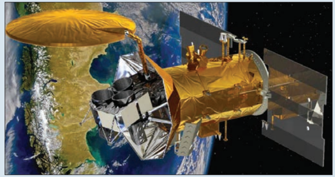
SAC-D mission was a collaboration between CONAE (Space Agency of Argentina) and INVAP, in cooperation with NASA, and space agencies of Brazil, Denmark, Italy and Germany.