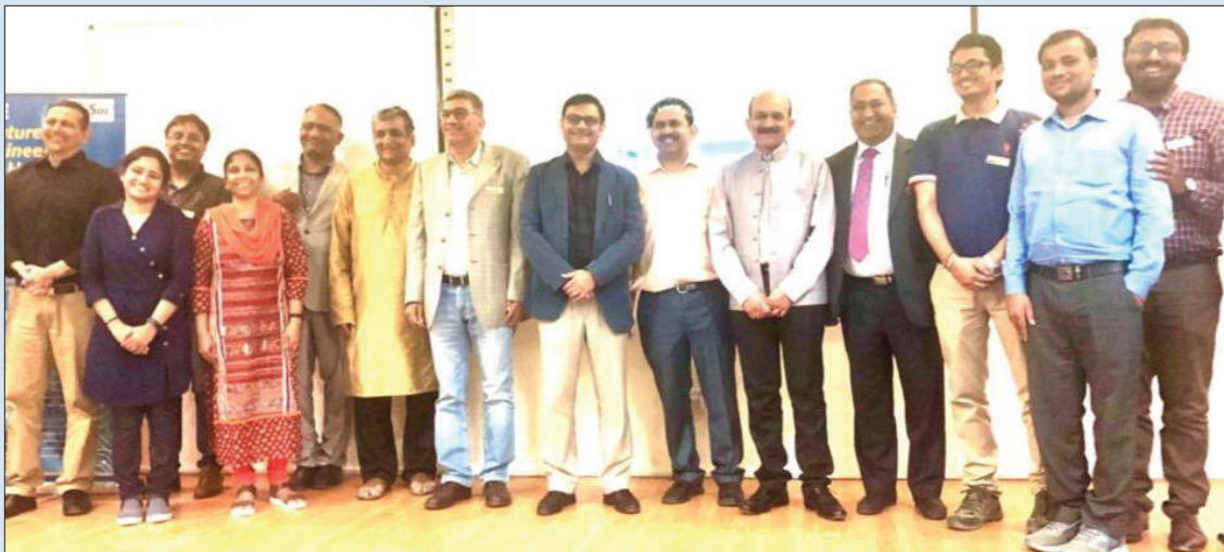
IEEE Bangalore ComSoc Chapter Execom 2020 Members whose dedication and commitment have made it possible to win CAA 2020 (APAC Best Chapter) Award.