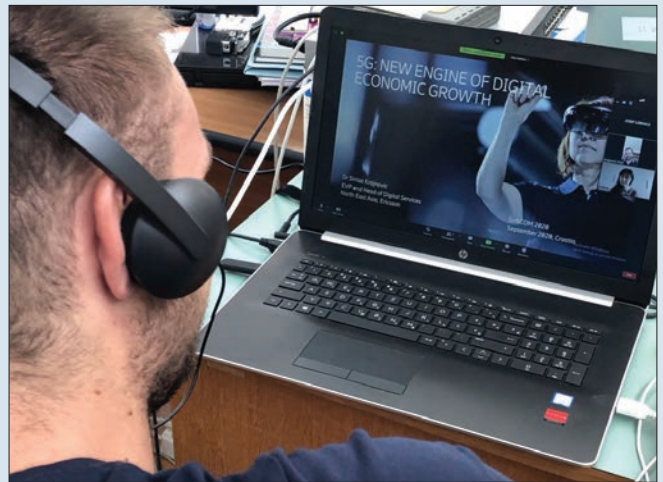
Attending the SoftCOM conference online.

The SoftCOM 2020 conference featured two events aimed at