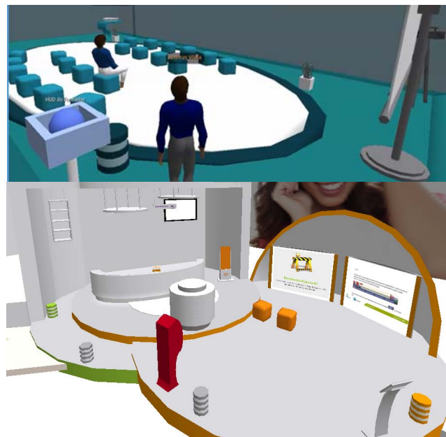
Figure 2. Training spaces with simple items and interactive elements

In this case, 'features' can be simple items, such as chairs, or interactive elements, such as voting booths, simulators or games. One such element is a presenter tool for virtual world slideshows, which we will use in this paper for clarity, so that readers can compare it with the operation of the SLOODLE presenter tool, described in section II.A. Figure 2 show two such spaces we created. Both have slideshow panels on the right side.