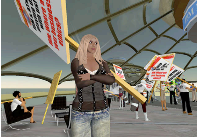
Figure 1. Virtual demonstrations

possession and persistence of property. Spontaneous effects including mass-protests, crime, harassment and even a plague, with consequent population migrations, have been witnessed in these environments. In each of these extreme examples (taking into consideration the current state-of-the-art), people participating in those virtual worlds tend to extend their personality through their avatars. This is made possible through the interaction with the world. The more a person gets involved in a virtual world, the more the avatar can become an extension of their actual character [4].