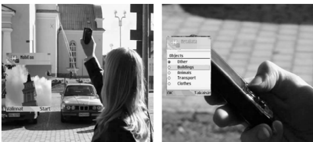
Fig. 2. Mobile video capture and annotation tool

For the creation of small video clips and their annotation right at capture time, the CANDELA personal mobile multimedia management platform provides a mobile video capture and annotation tool, which runs on mobile phones supporting Java 2 Microedition/MIDP 2.0 and the Nokia Mobile Media API [15].