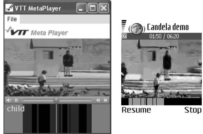
Fig. 4. Metaplayer

Once a video has been selected for viewing, it is streamed by the video manager to the user’s device via the Helix streaming server, along with information about the video segments relevant to the user’s query.