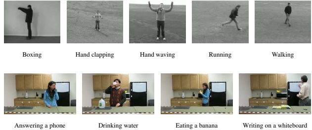
Figure 2: Sample frames from video sequences of the KTH (first row) and ADL (second row) datasets.

In order to quantize local features, we use the k -means clustering technique and nearest neighbour algorithm. To compute the bag-of-words representation, features are quantized to the codebook size of 1000, which has shown empirically to give good results. As a metric to calculate a distance between features and visual words, we use the L_2 norm. Since Harris3D corner detector calculates sparse spatio-temporal features, we set the weights w as w^{(x)} = 1 , w^{(y)} = 2 , w^{(t)} = 4 (Equation 5). To compute STOCF features, the HOG-HOF descriptors are quantized to small codebook sizes (10, 15, 20 and 25) and