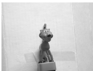
Figure 2: An image of a toy tiger.