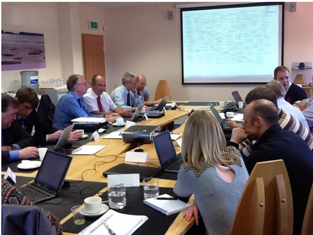
Figure 1: Example of a group using the Group Support System to surface and review risks