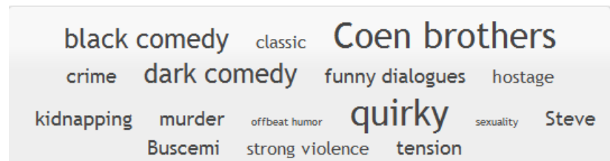
Fig. 2. Tag cloud (TC).

In our basic approach of using tag clouds as a not-yet-explored means to explain recommendations, we simply used the number of times a tag was attached to a movie as a metric of its importance