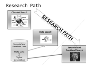
Fig. 3. Proposed research path

instantiation will be present and research will be done using the above mentioned tools and services. The first step comprises the usage of the existing search engines to feed the new emotional ontology with sensorial and information. That means a different approach to search events with result retrieving information for ontology instantiation. second step consists on using the instantiations as a database for emotions and sensations thus improving the ontology usage with semantic sensorial and emotional annotation. Finally the